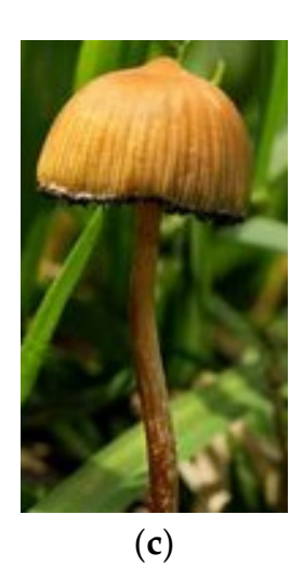
Figure 3. Cont.