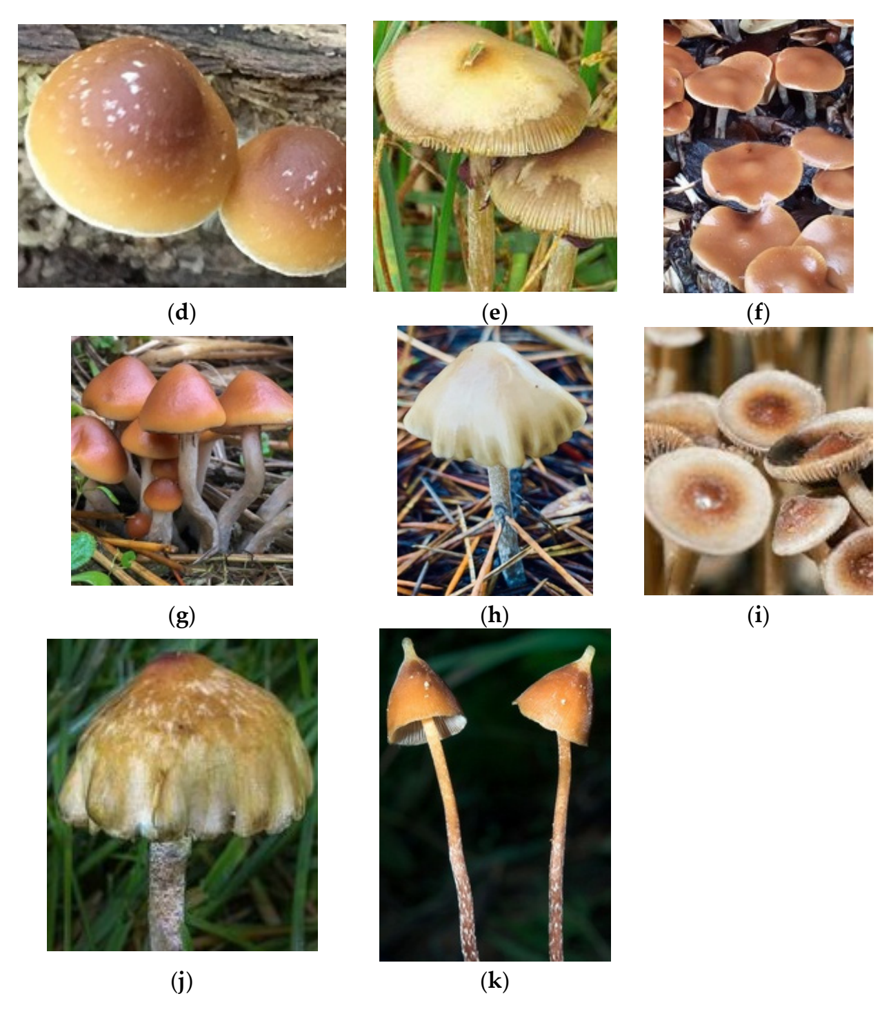
Figure 3. Examples of Magic mushrooms (psilocybin-producing mushrooms). (a) Psilocybe cubensis (Earle) Singer a.k.a Stropharia cubensis [131]. (b) Psilocybe caerulescens Murrill (a.k.a. Landslide Mushrooms, Derrumbes) [132]. (c) Psilocybe mexicana R. Heim (a.k.a. Teonanacatl, Pajaritos) [133]. (d) Psilocybe caerulipes (Peck) Sacc. (a.k.a Blue Foot Mushroom) [134]. (e) Psilocybe stuntzii Guzmán and J. Ott (a.k.a. Blue Ringer Mushroom, Stuntz's Blue Legs) [135]. (f) Psilocybe cyanescens Wakef. (a.k.a. Wavy Caps) [136]. (g) Psilocybe azurescens Stamets and Gartz (a.k.a Flying Saucer Mushrooms)' [137]. (h) Psilocybe pelliculosa (A.H. Sm.) Singer and A.H. Sm. [138]. (i) Psilocybe tampanensis Guzmán and Pollock (a.k.a Magic Truffles, Philosopher's Stone [139]. (j) Psilocybe baeocystis Singer and A.H. Sm. [140]. (k) Psilocybe Hoogshagenii R. Heim nom. inval. (a.k.a. Little Birds of the Woods) [141].